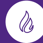
INDUSTRIAL HEATING OIL