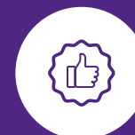
RISK MANAGEMENT AND HEDGING